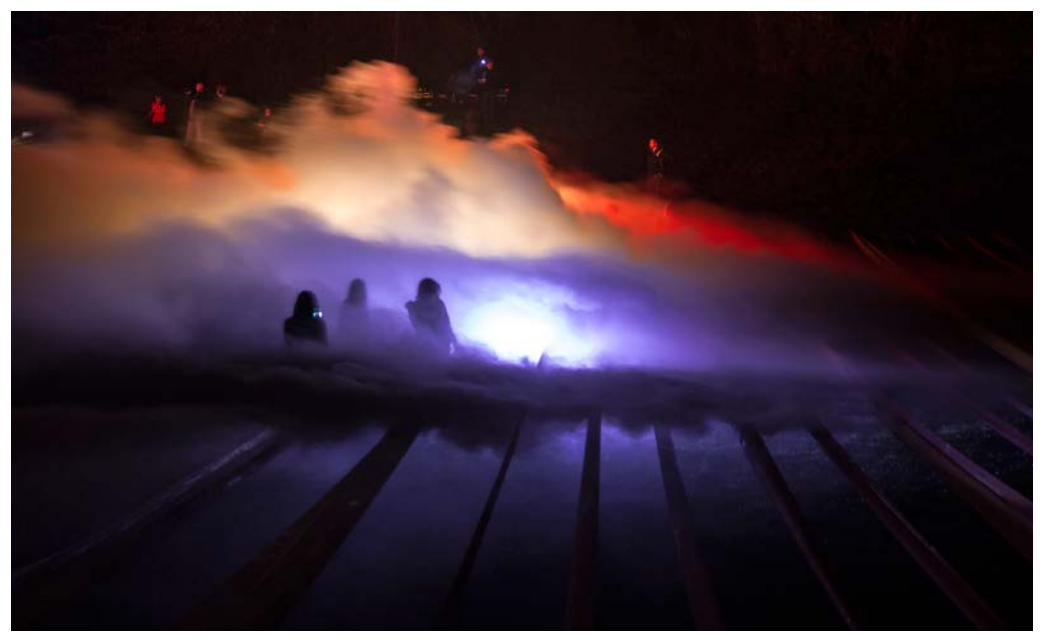
Lluèrnia 2015 Photo: Santi Palomé / Crater – Xavi Bayona Camó.

From the outset, Lluèrnia has provided a real environment for showcasing the work of students of architecture, art and design schools, university master's degrees in lighting design and any other discipline such as set design or ephemeral creation related to fire and light.