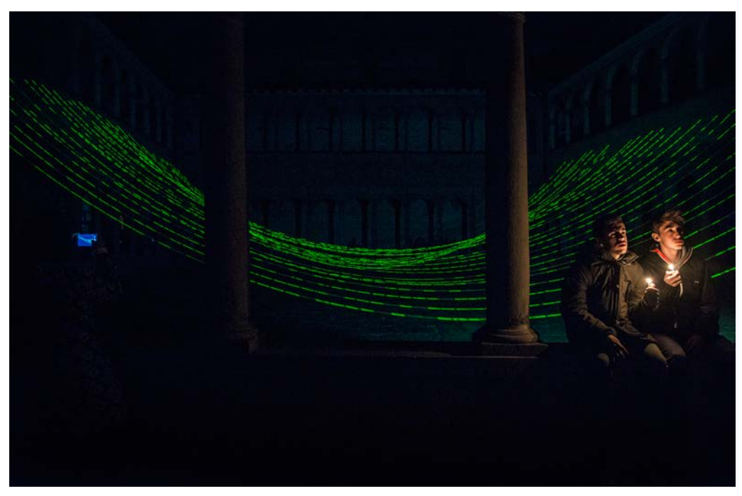
Lluèrnia 2018 Photo: Pep Sau / Llu(m)èrnia - EASD d'Olot. ESDAP Campus Olot.

estimated at over 20,000. It programmes around fifty ephemeral installations of unquestionable quality, as proven by the numerous external prizes awarded to some of them, and it is recognised at a national and international level as one of the benchmarks of ephemeral creation with the use of light and fire.