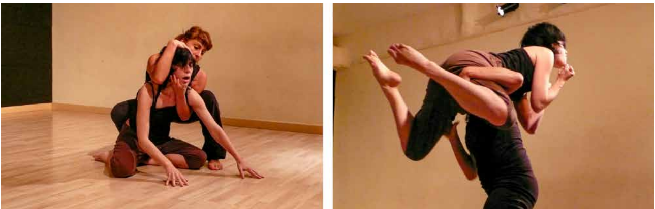
Figure 2. Class on the application of words.