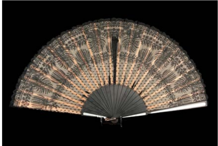
Chantilly fan in the lace collection of the Col·legi de l'Art Major de la Seda in Barcelona. Museu d'Arenys de Mar, registration number 517