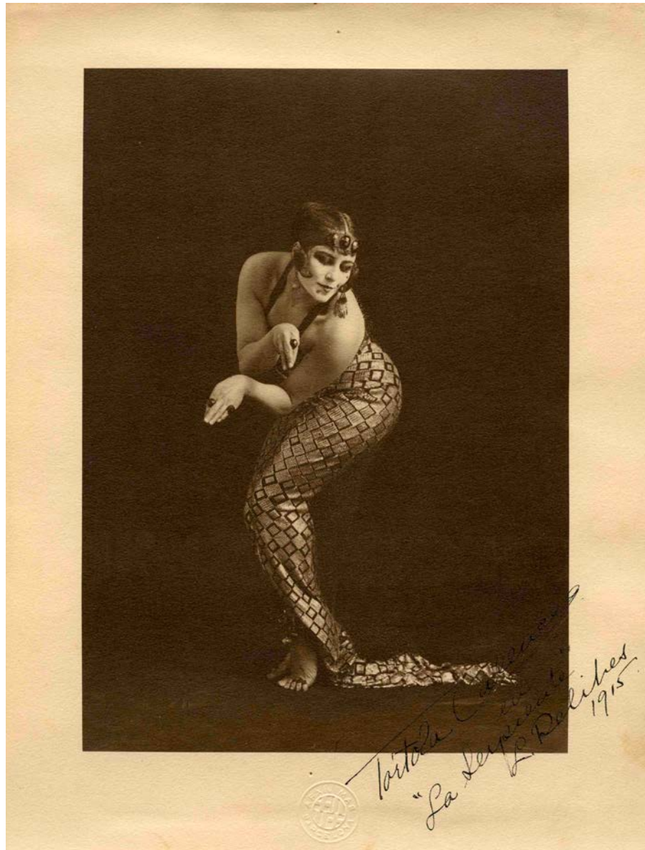
Tórtola Valencia in La Serp, 1915.

herself chose the image she wanted to transmit, and on the stage she controlled the message. Three photos have been found that reflect this relationship: in the Album de premsa de Tórtola Valencia. 1908-1910 , with MAE registration number 407060, there is a photograph published in Woman's Life on 6 June 1908. It shows Tórtola holding a magnificent Chantilly fan preserved in the lace collection at the Museu d'Arenys de Mar with registration number 518. 8 The same album provides a second example; in a cutting from London Sketches from February 1908 she appears in a Chantilly shawl held at the Museu d'Arenys de Mar with number 1730. Finally, in 1928 Tórtola Valencia was portrayed wearing a mantilla and a dance fan called pericón , an accessory held in the lace collection and property of the Col·legi de l'Art Major de la Seda in Barcelona, with registration number 517.