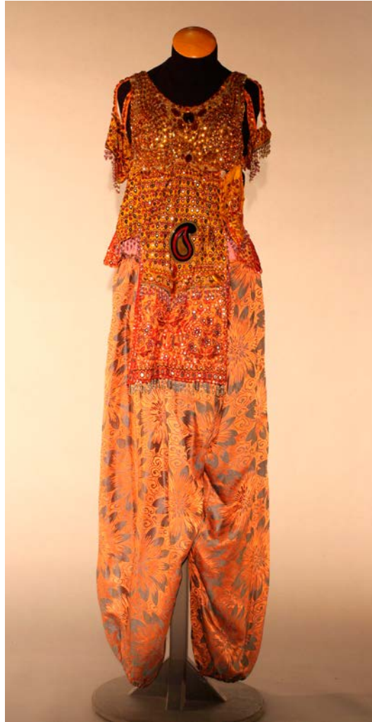
Costume for La Danza de Anitra .

©MAE. Institut del Teatre, registration number 252948