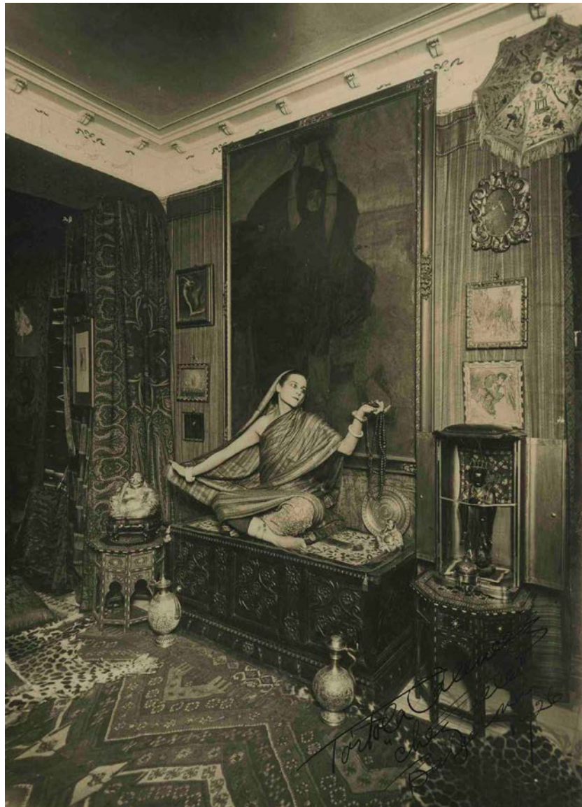
Tórtola Valencia at home, ca 1919. ©MAE. Institut del Teatre, registration number 256810

in 1971. 2 It includes a varied range of fabrics of over 1,717 pieces both in terms of techniques and provenance: fabrics from 16th century Europe and others from China, Turkey, Iran, India and Morocco, and a selection of pre-Columbian fabrics. The lace collection, which the Col·legi de l'Art Major de la Seda bought from Àngels Vila-Magret in 1960, has been held at the Museu d'Arenys de Mar since 1992. It consists of 200 pieces, some high quality, from the 16th to the late 19th century: they are pieces of clothing and domestic trousseau; there are also accessories, patterns and flounces that form part of the artist's dance wardrobe. Many of the objects have been dispersed among different private collectors, notably the collection of pre-Columbian sculptures at the Fundació Jordi Clos. 3