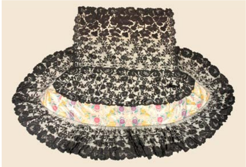
Mantilla for the dance, La Maja Blanca . ©David Castanyeda. Museu d'Arenys de Mar, registration number 1974

The characteristics do not suggest a quality mantilla, and a comparison with the outfit shows that it is an accessory. The dancer prioritised the colour and the mixture of materials to suit the mise en scène .