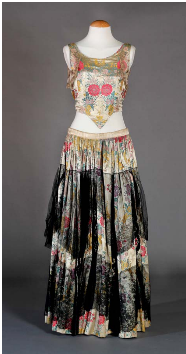
Costume for La Maja Blanca . ©MAE. Institut del Teatre, registration number 252861

Among the maja costumes held by MAE is the outfit of La Maja Blanca , with registration number 252861, which enables us to study the dancer’s work process. In this case, the costume is in store at MAE, but the mantilla, with registration number 1974, was included in the lace collection, probably because it was believed to be a goyesca mantilla. Study of the piece reveals it is formed by different types of mechanical lace flounces of low quality and different styles. The central element that falls down the shoulders is an embroidered fabric in coloured silk complemented by the fabric of the costume.