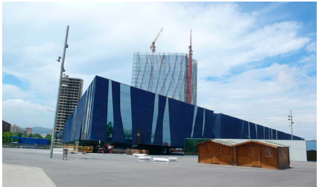
An amnesic space: architectural constructions such as the triangular building (now Museu Blau) by the Swiss architects Herzog and De Meuron frame the esplanade of the Barcelona Forum, where El Camp de la Bota was located. Photo © Kathrin Golda-Pongratz, 2010.

It is worth highlighting here the key role that artists and civil society play in influencing such processes and, in the end, helping shape and depicting memory. In the case of El Camp de la Bota , a major step was taken in 2010,