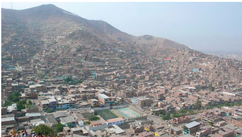
The neighbourhood of El Ermitaño, which emerged in the 1960s in the northern area of Lima, today. Beyond the well-established self-built city, new invasions have taken place in vulnerable areas.

revise the concept of city-region and macroregion that, in the early 21st century, has assumed a hitherto unknown scope.