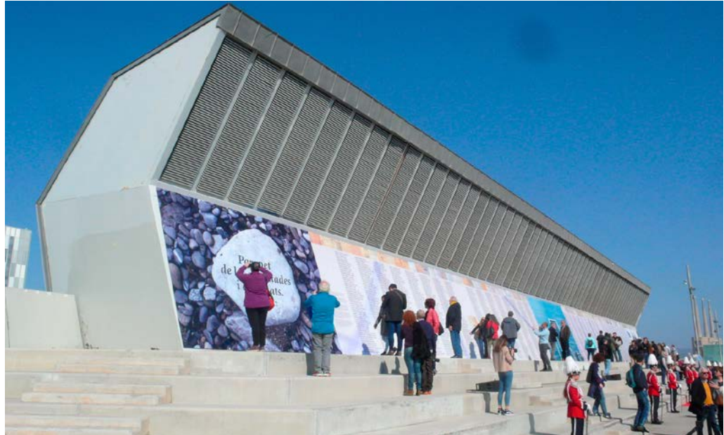
Municipal opening of the installation with the 1,706 names in the space of the Barcelona Forum on 24 February 2019.

promoted by the Memorial Democràtic de Catalunya: 7 although somewhat distant from the leisure areas and not very visible to the general passerby, an explanatory plaque about the events was placed where the wall was thought to have been – on the side of Sant Adrià del Besòs. In 2015, the mobilisation of the families of the victims and the creation of a civic platform helped make the name visible again in the urban space, and to commemorate and dignify the slum experience of the working people of this urban periphery, which for decades had overlapped with political violence in the place. They are acts that kindled hopes that, in the long term, there can be a symbolic articulation in the same place, capable of reconstructing its painful identity and integrating it into a new urban layer in the current leisure context, the early 21st century product of speculative urbanism without memory.