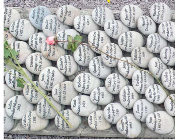
The stones that form the labyrinth bearing the names of the victims, in alphabetical order.

The work's core consists of a huge stone found by the artist close to a pre-Hispanic cemetery in the north of the country, probably discarded by tomb raiders. As such, it is also a symbol of the lack of respect for pre-Hispanic cultures in Peru. Around the stone, 40,000 boulders bearing the names of all the victims have been placed in the form of a labyrinth. A sculptural site that, however, is in constant danger while there is no reconciliation capable of transforming the memory into events, actions, meetings and tributes to overcome pain and do justice. It has been attacked on several occasions and partially destroyed by sympathisers of Fujimori. The work had endured a long path until it was created, during which a ruling by the Inter-American Court of Human Rights, which sentenced the Peruvian state for the killing of 41 terrorists in a prison, gave the order to provide redress for the victims and inscribe their names on the stones of the monument. This decision caused very serious controversy and showed again the breach that still exists in Peruvian society.