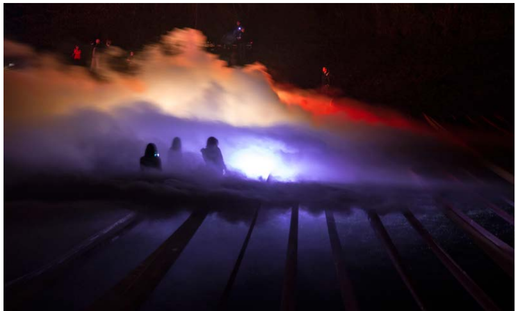
Lluèrnia 2015 Photo: Santi Palomé / Crater – Xavi Bayona Camó.

From the outset, Lluèrnia has provided a real environment for showcasing the work of students of architecture, art and design schools, university master's degrees in lighting design and any other discipline such as set design or ephemeral creation related to fire and light.