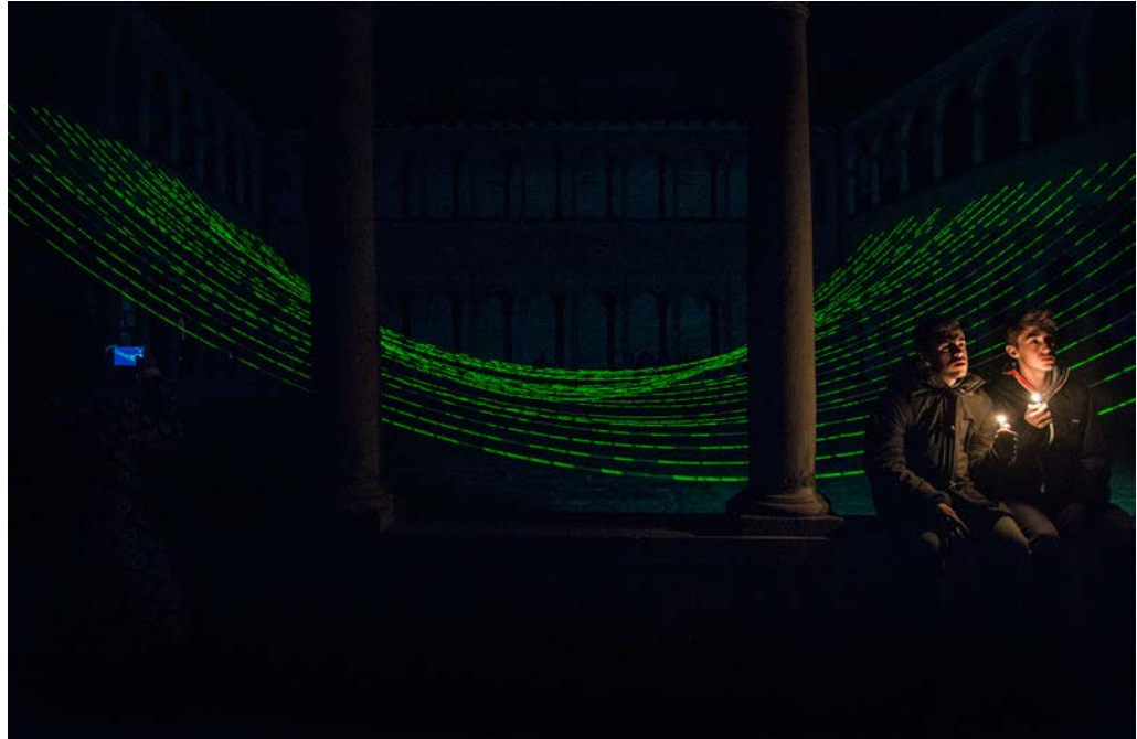
Lluèrnia 2018

estimated at over 20,000. It programmes around fifty ephemeral installations of unquestionable quality, as proven by the numerous external prizes awarded to some of them, and it is recognised at a national and international level as one of the benchmarks of ephemeral creation with the use of light and fire.