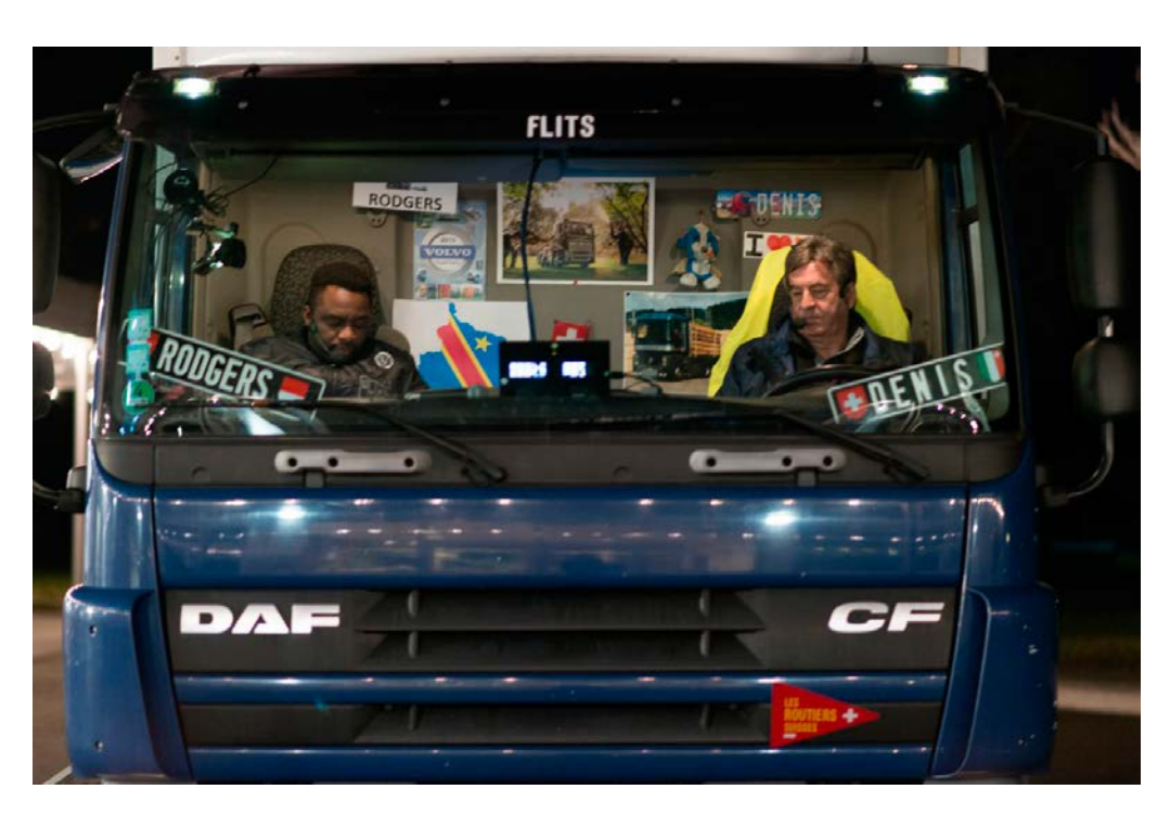
Rimini Protokoll transformed a truck into a theatre.

HH: Sure, it's definitely a combination. With Do's & Don'ts we use the eyes of a child for example. Of course, you remember how you grew up in the city and what you were looking for, and which rules you understood, and when you enjoyed breaking them and how important it was to question and break them!