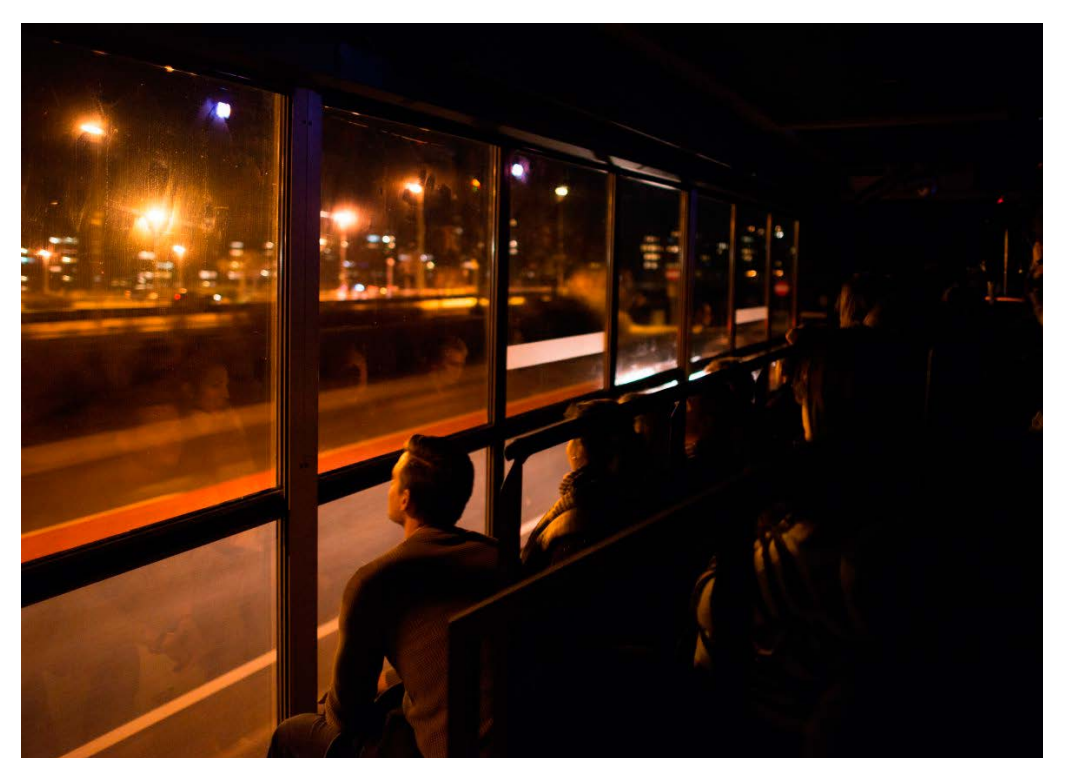
Rimini Protokoll's truck transformed into a theatre.

HH: Yes, I think it's often touching when you slip into the perspective of a stranger, instead of just staying in your own little bubble. I think it's all about opening this and getting in this perspective of, for example, the police guy. To say, "oh, it's a police guy", but suddenly you also understand his role in our society.