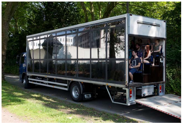
Rimini Protokoll's truck transformed into a theatre.

then the audience gets iPads and the films guide them into the set and make them follow their actions, while the real protagonists are gone.